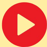
Apple Support Channel on YouTube